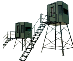
ELEVATION KIT 5' - $1,535 | 10' - $2,325

Being aluminum framed and fully insulated gives you the rigidity and comfort for any weather conditions. The Phantom hunting blind is 5'x5' with 4 windows and equipped with four leg brackets that accept a 4"x4" for added elevation.