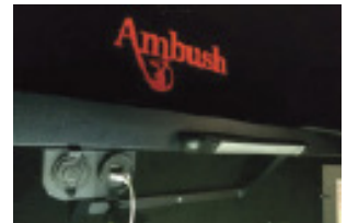
LIGHT KIT - $95